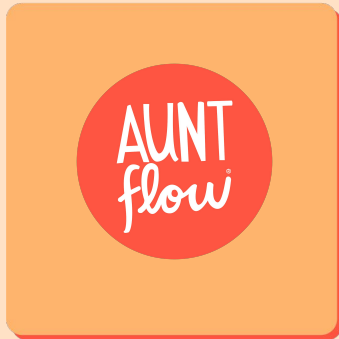
Aunt Flow Logos