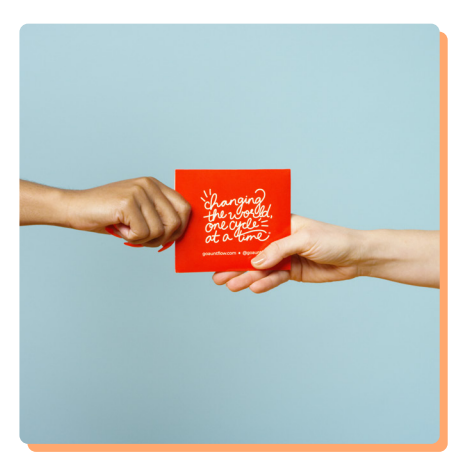
Menstrual Justice Is a Matter of Health Equity: How to Fight Period Poverty and Stigma