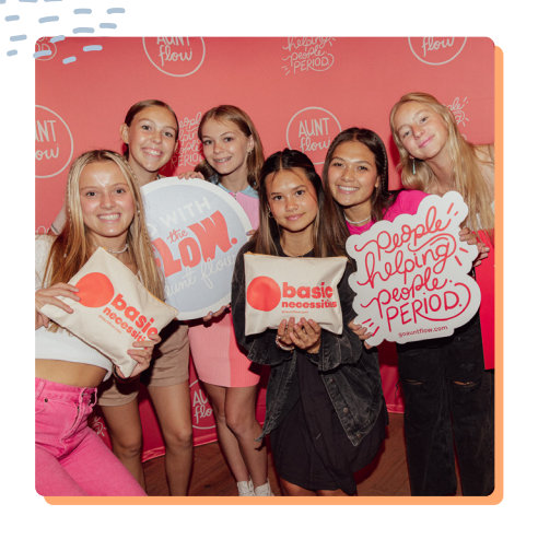
The Policy Project and Aunt Flow Hold Period Party to Pack Up to 3,000 Period Kits for Youth in Need