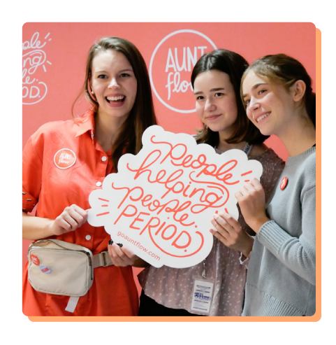
Period Products Aren't Free or Accessible in Schools. Students Want to Make That Happen